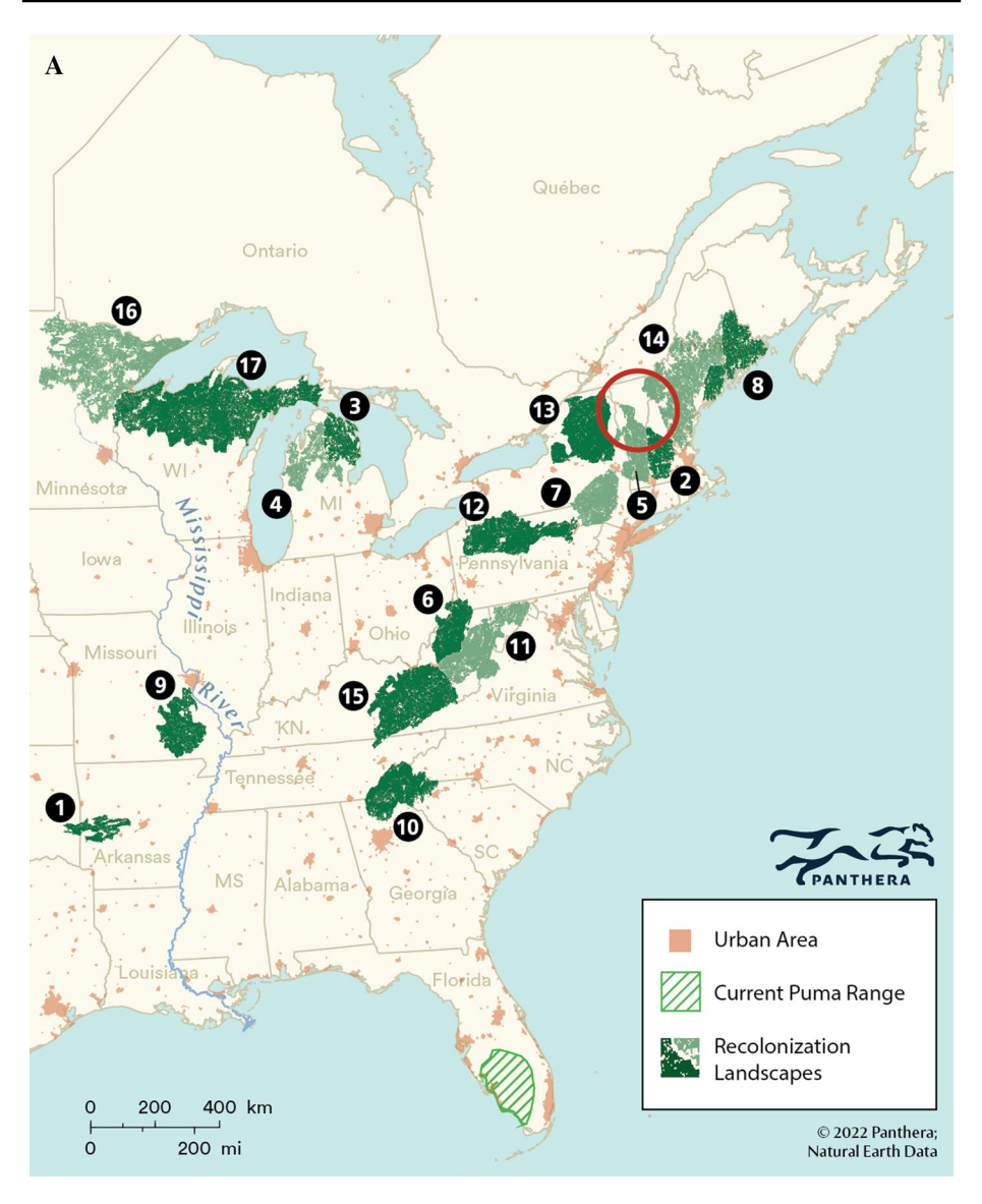
Fig. 2 a Overview of Potential habitat patches that could support pumas identified by our analyses (shown in light and dark green) in the eastern United States, in relation to urban areas (shown in orange). b Close up of identified suitable areas for puma recolonization in the New England. (Color figure online)