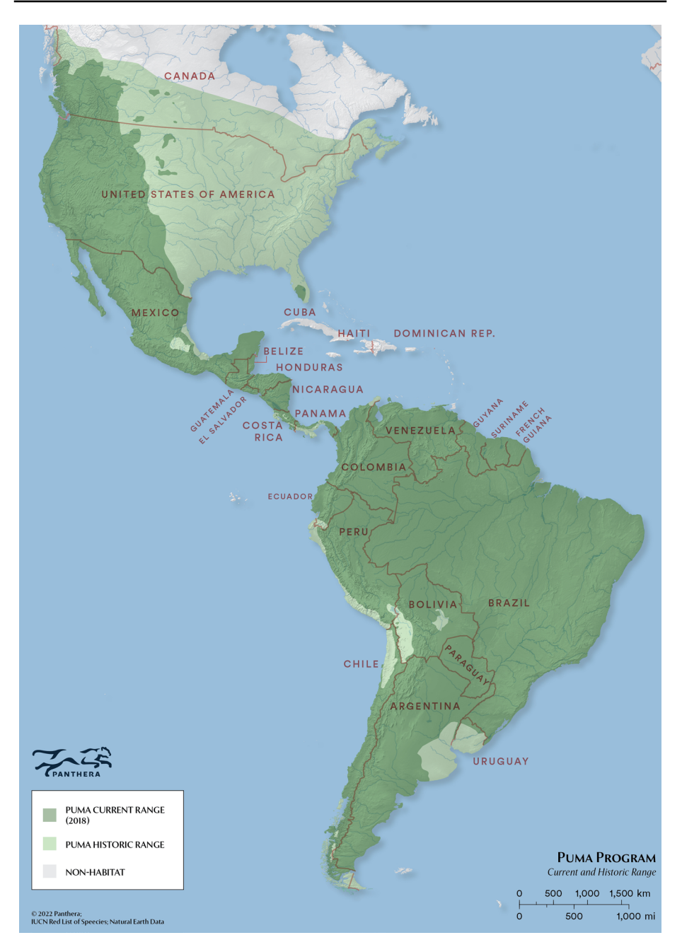
Fig. 1 Current (shown in dark green) and historic (shown in dark green and light green combined) puma range. The largest unoccupied area, or the area with the largest opportunity for recolonization, is the eastern two-thirds of the USA. Figure adapted from IUCN Red List of Threatened Species: Puma concolor . (Color figure online)